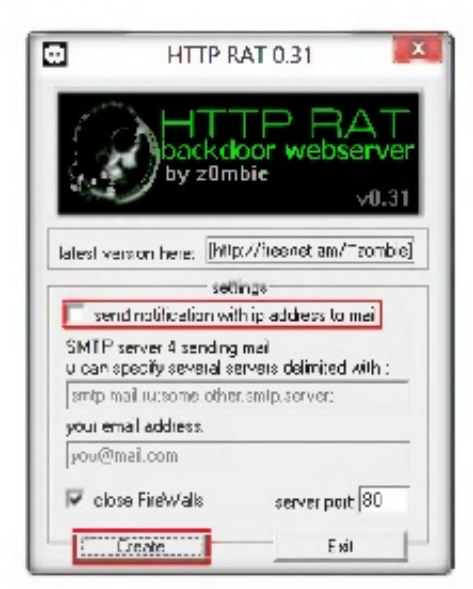
FIGURE 5.6: Creme backdood