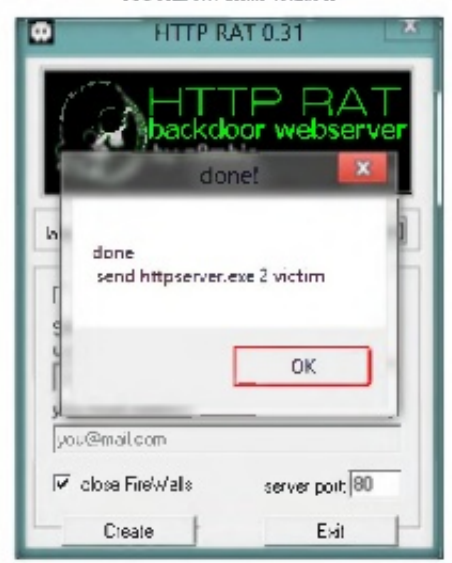
FIGURE 5.7: Backdoor server crewed successfully